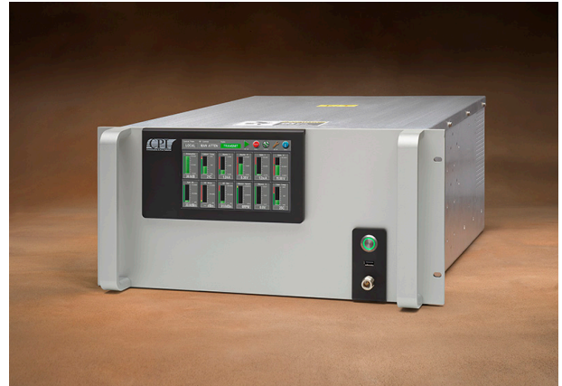
CPI 250/320 W S/C-band TWTAs, Model TZSC6963J1

Backed by over 40 years of satellite communications experience, and CPI's worldwide 24-hour customer support network that includes more than 20 regional factory service centers.